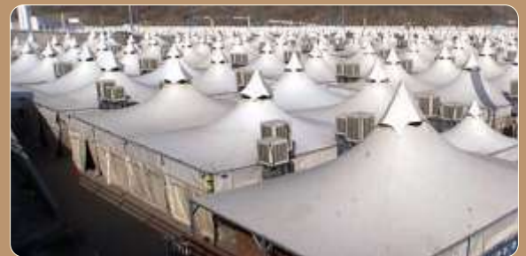
@ MINA VIP Tent No. 1