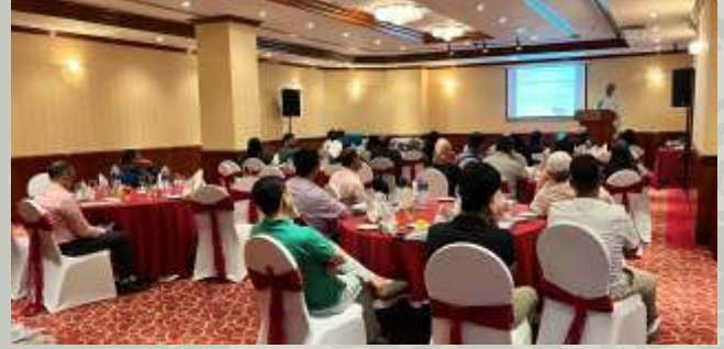
Orientation Program at Dubai