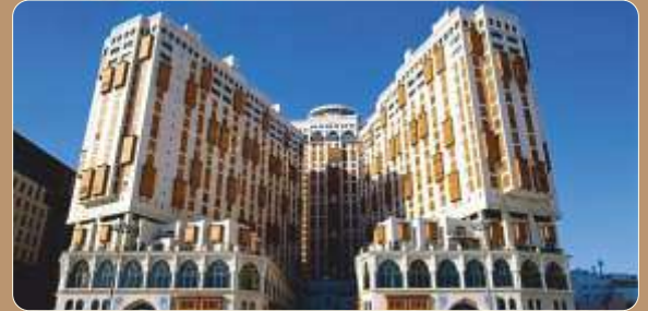
@ MAKKAH Hotel Makkah