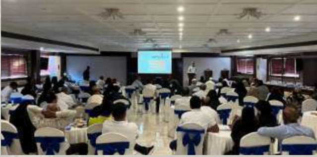
Orientation Program at Udupi