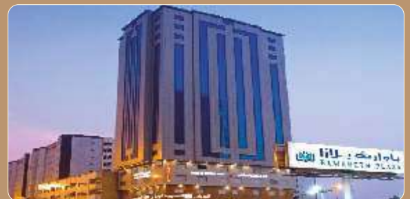
@ AZIZIYA Royal Al-Mashaer