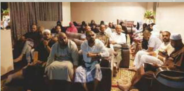
Haj School at Makkah