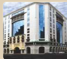
Rowda Royal Inn