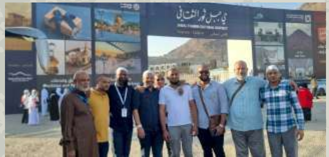
Visit to historical places