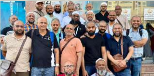
A Day Out