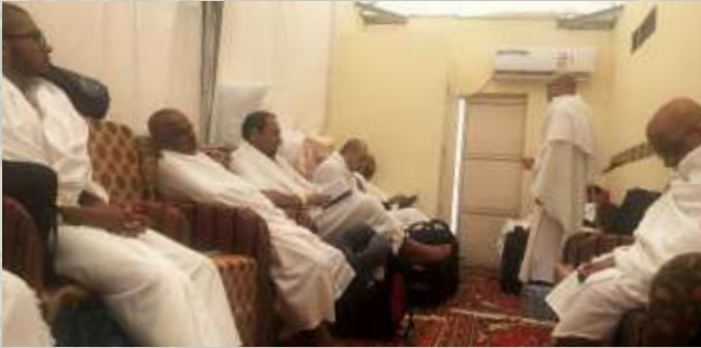
Hajis at Mina tent