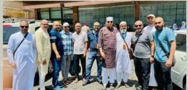
Visit to Jeddah