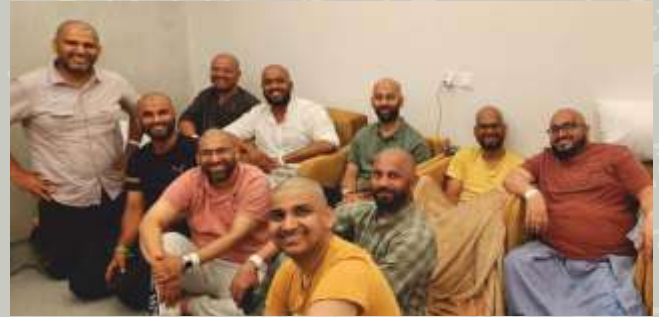
Hajis relaxing at Mina tent