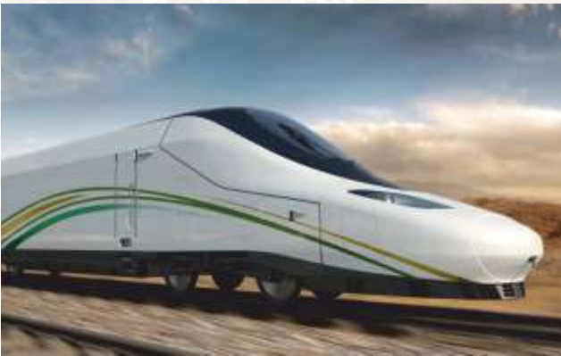
Haramain High Speed Train