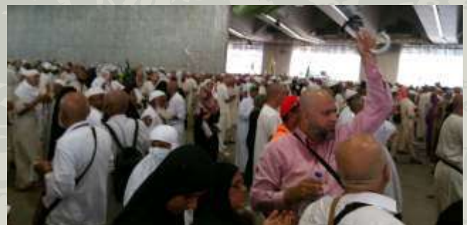
Organised pebbling at Jamarath